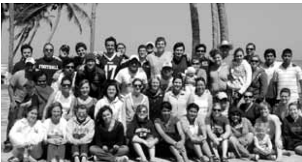
Retreat at the beach.