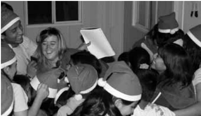
Christmas at the orphanage.

Sunday, March 21, 2:45 a.m. I was in bed but not sleeping when I started thinking about the "big day", the day of my rebaptism. I was born and raised in a Christian family. I have always been a big fan of JC ... that's why I was baptized at 13. I knew by then that Jesus is my Savior and my best friend. But a lot of things have happened since then: my dad's death, letting everything have an impact on my self-esteem, being depressed, prioritizing my boyfriend over God, caring more about my identity than God, and having thoughts and actions that didn't portray my identity in Christ. I wanted to be baptized again because I realized that although I had already decided to follow Jesus, there are things on my path that are keeping