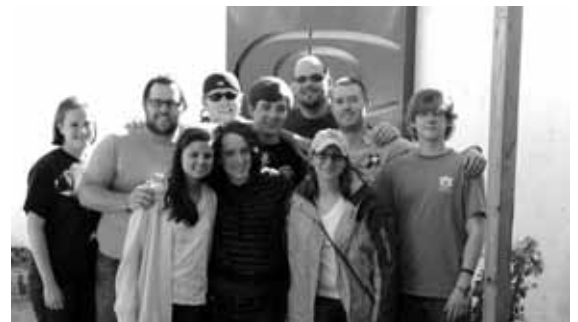
Auburn Christian Fellowship group who poured themselves into our ministry.